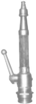
Order No: FHN-3

Jet/Spray Nozzle with Instantaneous Branchpipe.