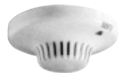
Order No: FSD Ionization Smoke Detector