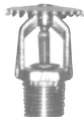
Order No: SP Upright