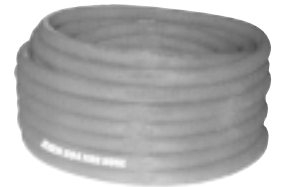
Order No: FHR-1 Hose Reel Hose