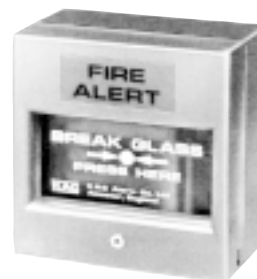
Order No: FBG Break Glas