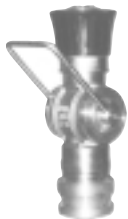
Order No: FHN-5

Diffuse Nozzle with Instantaneous Coupling