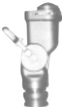
Order No: FHN-6

Three Position Nozzle with Instantaneous Coupling