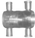
Order No: FAR-2 Double Female Instantaneous