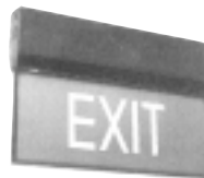
Order No: FE1