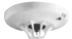
Order No: FHD Heat Detector