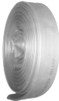
Industrial White Fire Hose (Type: Canvas)