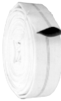
Fire Brigade Red Fire Hose (Type: Flowtex)