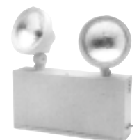
Order No: FEL Self Contained Emergency Lighting