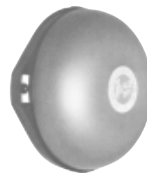
Order No: FA Fire Alarm Bell