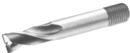
Slot drill 2 fluted