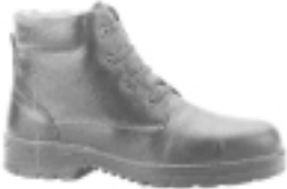
S 803 6" Black grain leather Ankle collar