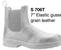
S 706T 7" Elastic gusset slip-on black grain leather