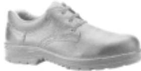
S 800 Black grain leather Ankle collar