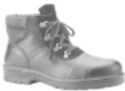
S 901 6" Black grain leather Ankle padded