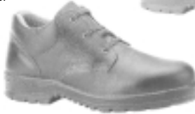
S 701 5" Black grain leather Ankle collar