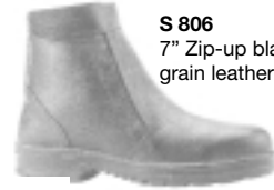
S 806 7" Zip-up black grain leather