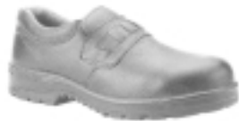
S 807 Slip-on black grain leather