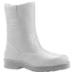
S 805K 10" Slip-on orange grain leather