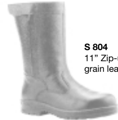
S 804 11" Zip-up black grain leather