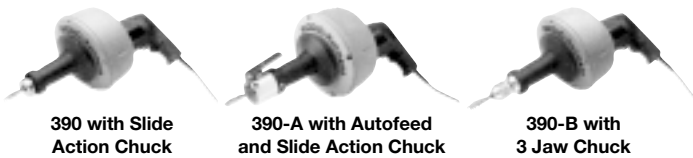
390 with Slide Action Chuck