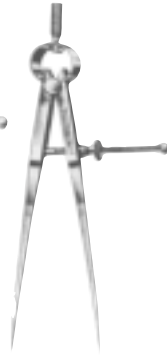
Order No: MSD Spring Dividers