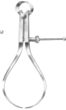
Order No: MSO Spring Outside Calipers