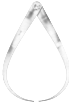
Order No: MFO Firm Joint Outsider Caliper