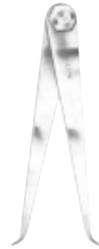
Order No: MFI Firm Joint Insider Caliper