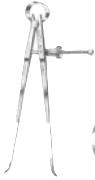
Order No: MSL Spring Insider Calipers