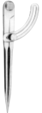
Order No: MWD Wing Divider